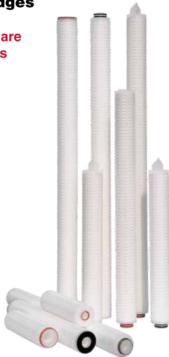
Pleated Teflon® Membrane Cartridges