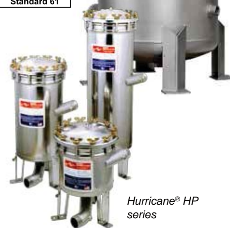
Hurricane® HP series

* Test through IAPMO QFT Laboratory, LLC. to NSF/ANSI/CAN Standard P473