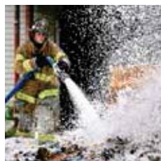
Firefighters using fire retardant foam containing PFOS/PFAS