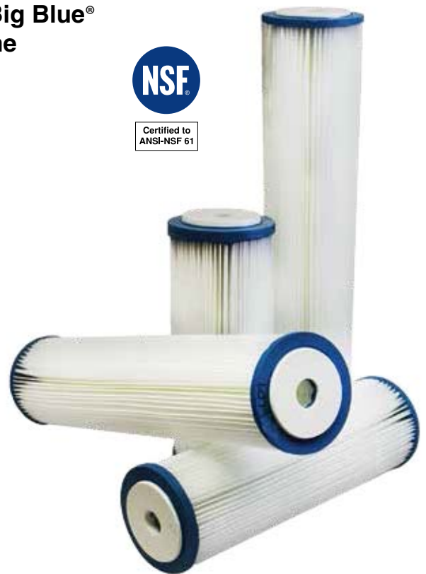
Harmsco® SureSeal™ Series Cartridges