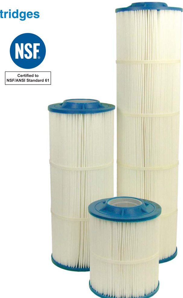
Premium Hurricane® Polyester Cartridges

High flow capability Lower overall operating cost Reduced waste disposal Longer filter runs for fewer change-outs Increased contaminant removal Operator friendly