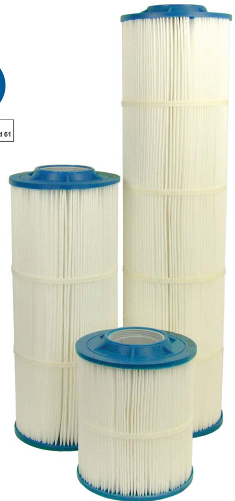
Premium Hurricane® Polyester Cartridges