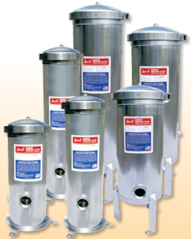
Models BC4-1, BC4-2, BC4-3, BC6-1, BC6-2, BC6-3