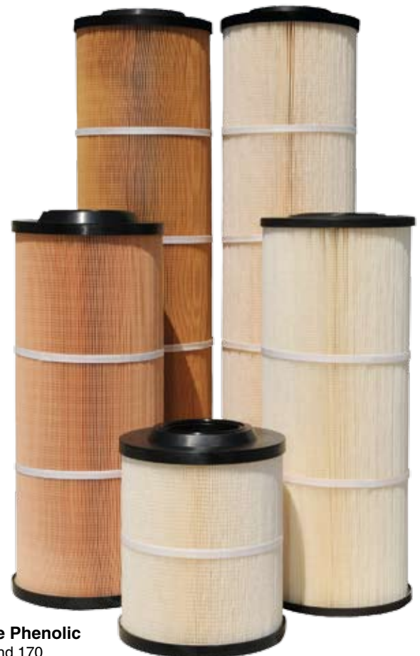
Cellulose Phenolic 90 and 170